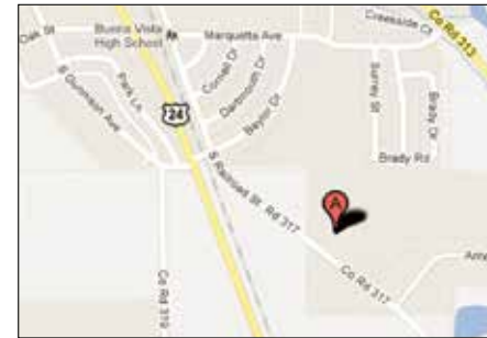
HRRMC Buena Vista Health Center 28374 County Road 317, Buena Vista, CO 81211 719-395-9048